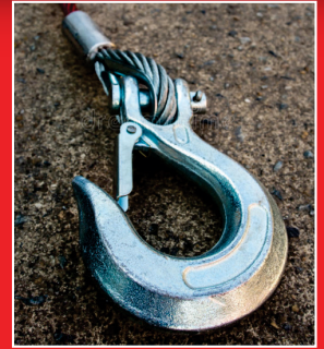
Order hook & cable separately