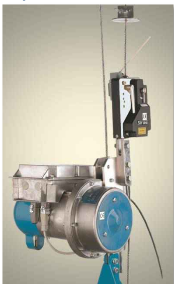
CX 500 with Sky Lock

Whether you need to reach, new heights or fit into tight places, or both, turn to SKY CLIMBER®. The COMPACT and CX 500 hoists from SKY CLIMBER® are part of the innovative family of specialized suspended platform hoists.