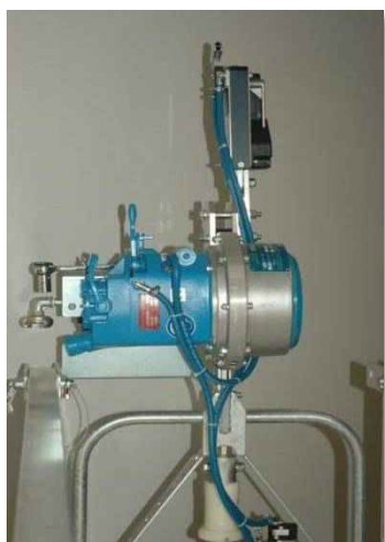
CX 500 pneumatic hoist with Sky Lock