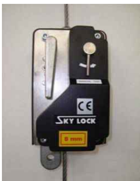
Sky Lock III 8 mm