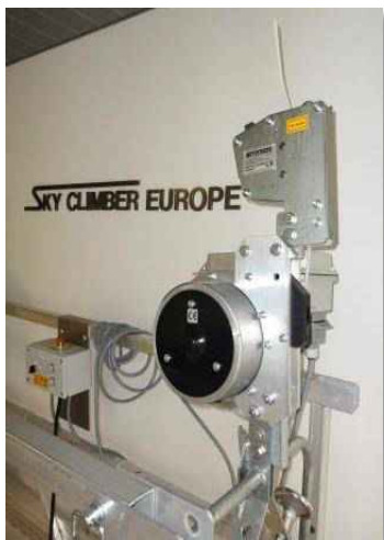
COMPACT with Sky Grip (CE)