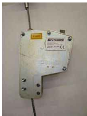
Sky Grip 8 mm

SKY CLIMBER® ACCESS INNOVATIONS SINCE 1955