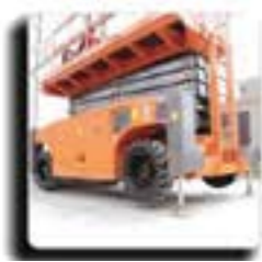
Automatic Levelling Outriggers