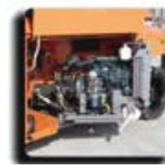
Swing Out Engine Tray