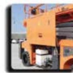
Vertical Style Lift Gate