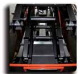
Fully Protected Chassis