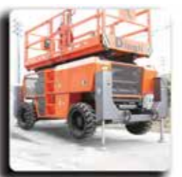
Automatic Leveling Outriggers