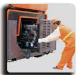
Slide-Out Engine Tray