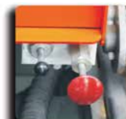
Brake Release Valve