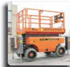
Automatic Leveling Outriggers