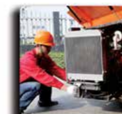
Swing-out Engine Tray